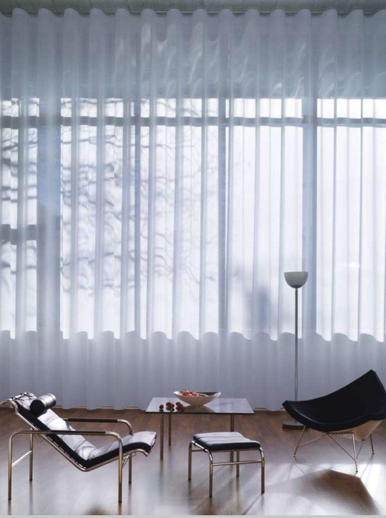
Wave XL with Silent Gliss 5400

Wave® – A new Dimension in Curtain Making